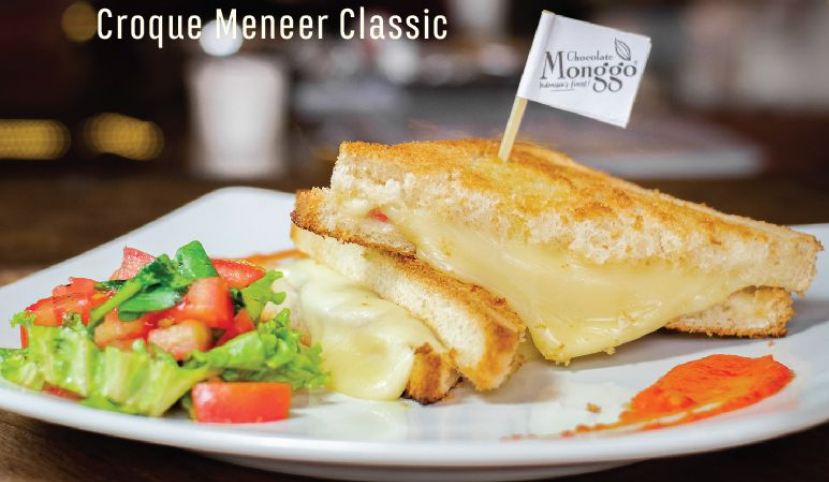
Croque Meneer Classic