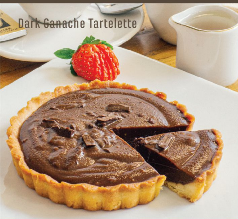
Dark Ganache Tartelette