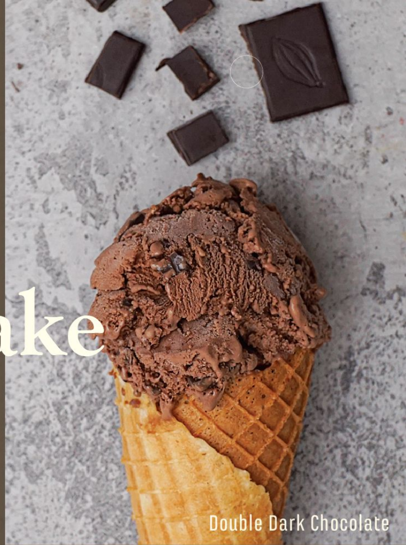
Double Dark Chocolate

We only use Fresh Milk, French Cream, Fresh Fruits, Natural Flavours and Organic Eggs!