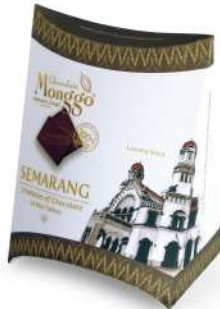
Lawang Sewu Semarang Box