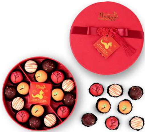
Chinese New Year