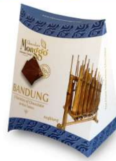
Angklung Bandung Box