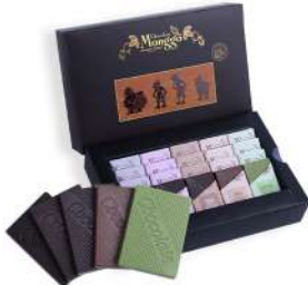
PUNAKAWAN - JOGJA Box 20 x 5,5g Dark Chocolate Rp 110.000

20 mini tablets of 5 difference chocolates: MATCHA, MILK, VOLCANIC SALT, DARK CHOCOLATE 77% OF COCOA and DARK CHOCOLATE 58% OF COCOA.