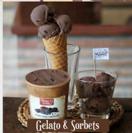
Gelato & Sorbets