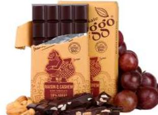
RAISIN & CASHEW NUTS 100g | Rp 75.000 DARK CHOCOLATE 58% OF COCOA with RAISINS AND ROASTED CASHEW NUTS.