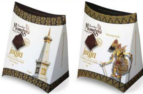
Tugu Jogja Box