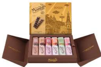
JOGJA GIFT BOX 6x40g | Rp 200.000

20 mini tablets of 5 difference chocolates: MATCHA, MILK, VOLCANIC SALT, DARK CHOCOLATE 77% OF COCOA and DARK CHOCOLATE 58% OF COCOA with Kintamani Coffee.