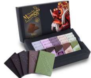
RARUNG - BALI Box 20 x 5,5g Dark Chocolate Rp 110.000

20 mini tablets of 5 difference chocolates: MATCHA, MILK, VOLCANIC SALT, DARK CHOCOLATE 77% OF COCOA and DARK CHOCOLATE 58% OF COCOA.