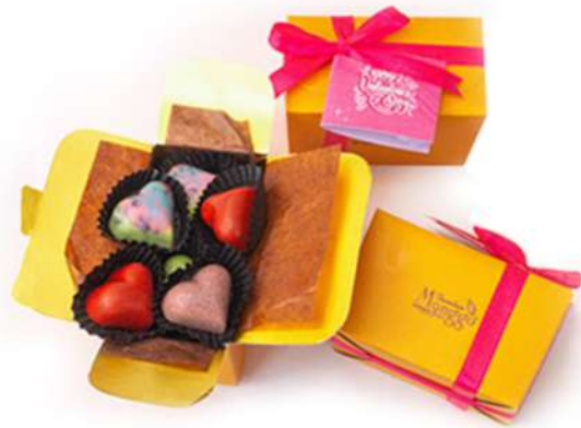
Valentine's Day 14 th February