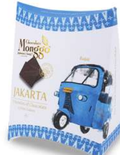
Bajaj Jakarta Box