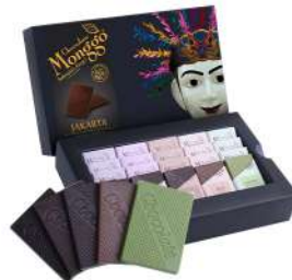
ONDEL-ONDEL - JAKARTA Box 20 x 5,5g Dark Chocolate Rp 110.000

20 mini tablets of 5 difference chocolates: MATCHA, MILK, VOLCANIC SALT, DARK CHOCOLATE 77% OF COCOA and DARK CHOCOLATE 58% OF COCOA.