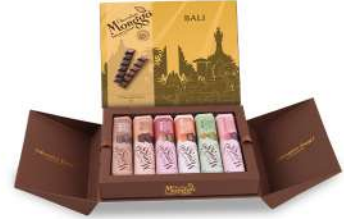
BALI GIFT BOX 6x40g | Rp 200.000

6 Varieties of Chocolate Bar: DARK CHOCOLATE 58%, MILK CHOCOLATE 45%, GIANDUJA, SALTY CARAMEL, MATCHA and STRAWBERRY.