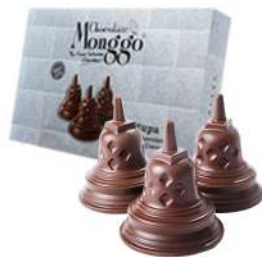
STUPA - BOROBUDUR Box 10 x 9g | Rp 92.000 DARK CHOCOLATE 58% of Cocoa.

6 Varieties of Chocolate Bar: DARK CHOCOLATE 58%, MILK CHOCOLATE 45%, GIANDUJA, SALTY CARAMEL, MATCHA and STRAWBERRY.