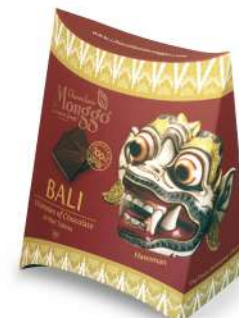
Hanoman Bali Box