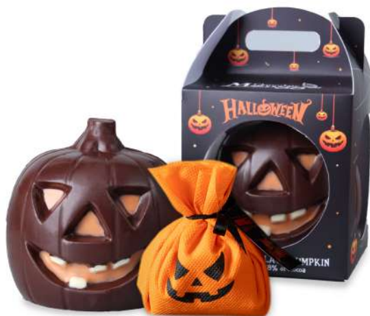
Halloween 31 st October