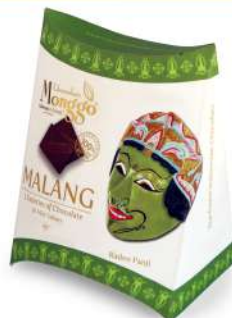
Raden Panji Malang Box