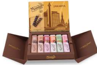
JAKARTA GIFT BOX 6x40g | Rp 200.000

6 Varieties of Chocolate Bar: DARK CHOCOLATE 58%, MILK CHOCOLATE 45%, GIANDUJA, SALTY CARAMEL, MATCHA and STRAWBERRY.