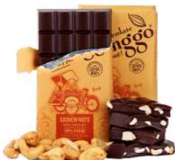
CASHEW NUTS 100g | Rp 75.000 DARK CHOCOLATE 58% OF COCOA with ROASTED CASHEW NUTS.