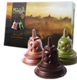
STUPA MIX - BOROBUDUR Box 10 x 9g | Rp 92.000 3 Varieties of Chocolate: MILK, DARK 77% and MATCHA.