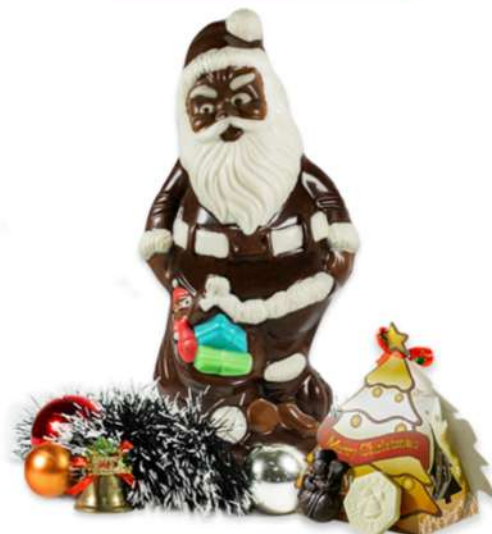
Christmas 25 th December