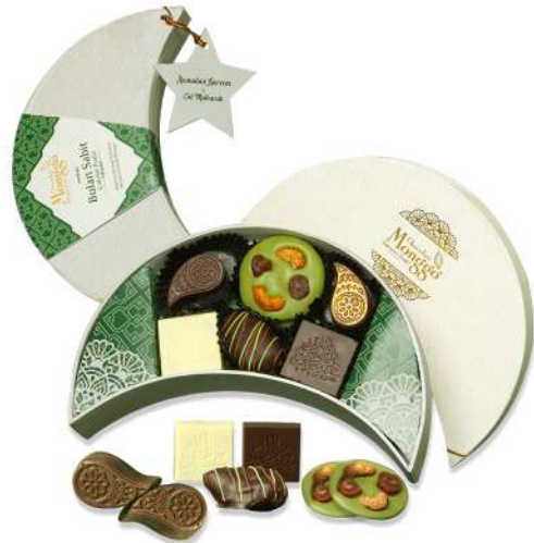
Ramadan - Idul Fitri