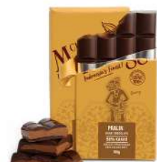
PRALINÉ 100g | Rp 75.000 DARK CHOCOLATE 58% OF COCOA with CASHEW NUTS CREAM.