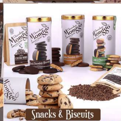
Snacks & Biscuits