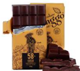
DARK 58% COCOA 100g | Rp 75.000 DARK CHOCOLATE 58% of Cocoa.